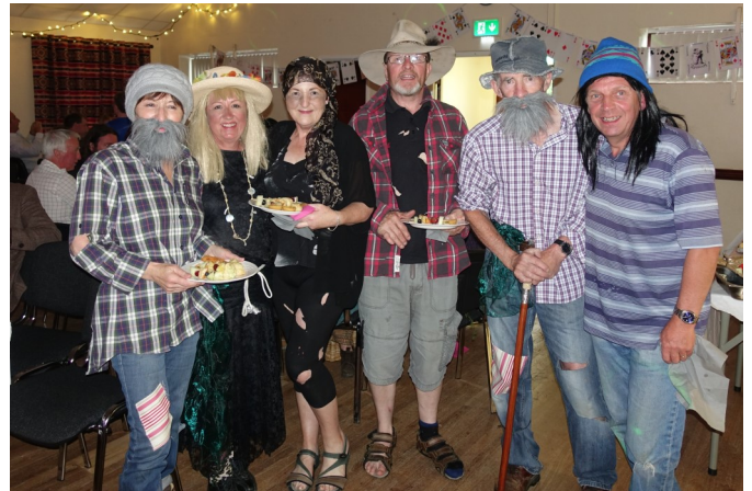
A few of the 'tramps' who danced the night away at the Ball

Many thanks to all who contributed towards the raffle prizes.